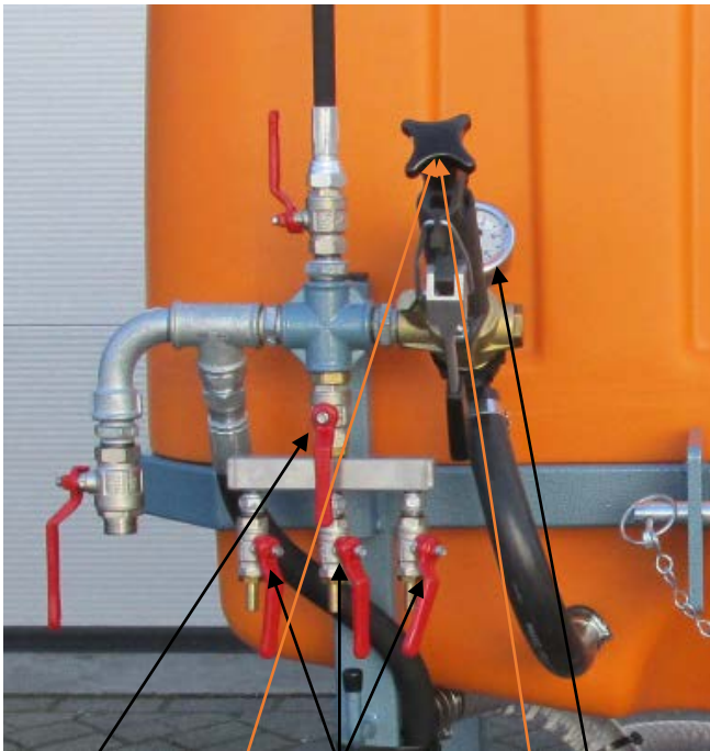
Main valve (feeding) Distribution valve Pressure regulator Manometer Release handle